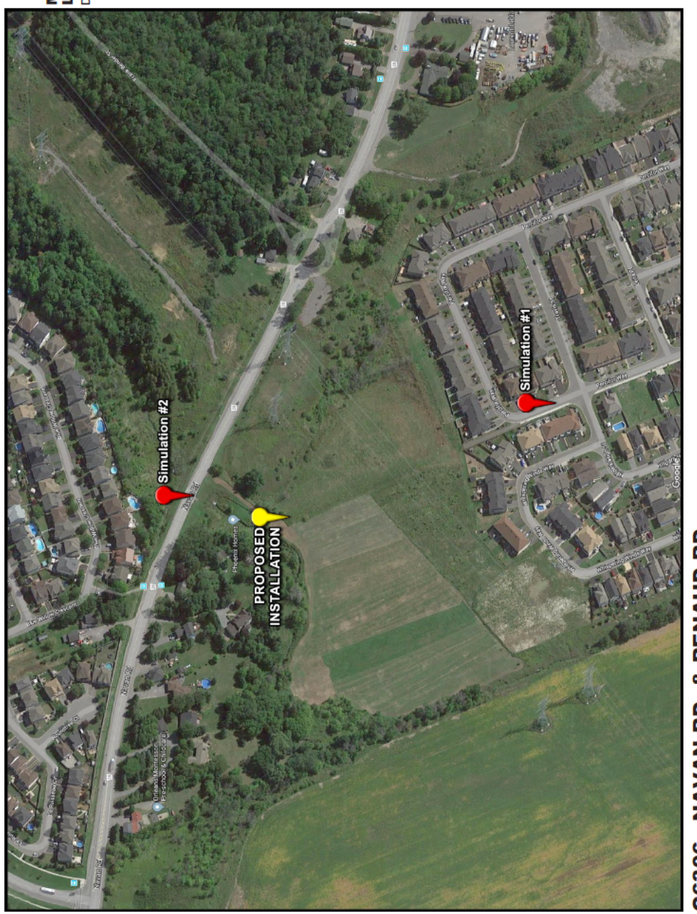
C6306 - NAVAN RD. & RENAUD RD.